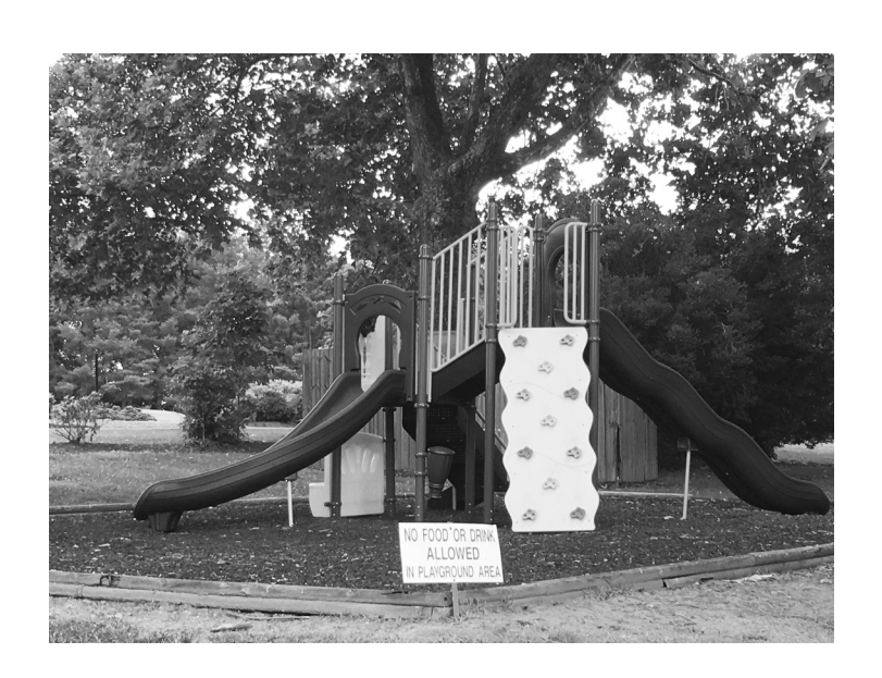
New Playground Equiment